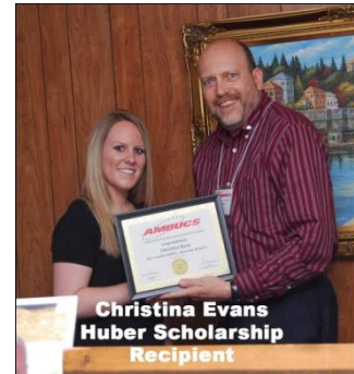
Christina Evans Huber Scholarship Recipient