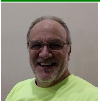
Hey, all you ramp-builders -

We had a busy month of ramp-building! We've had great weather, plenty of lumber, and a whole lot of smiles and willing volunteers to build four ramps in May. Here's a sample of what we can do when we get together.