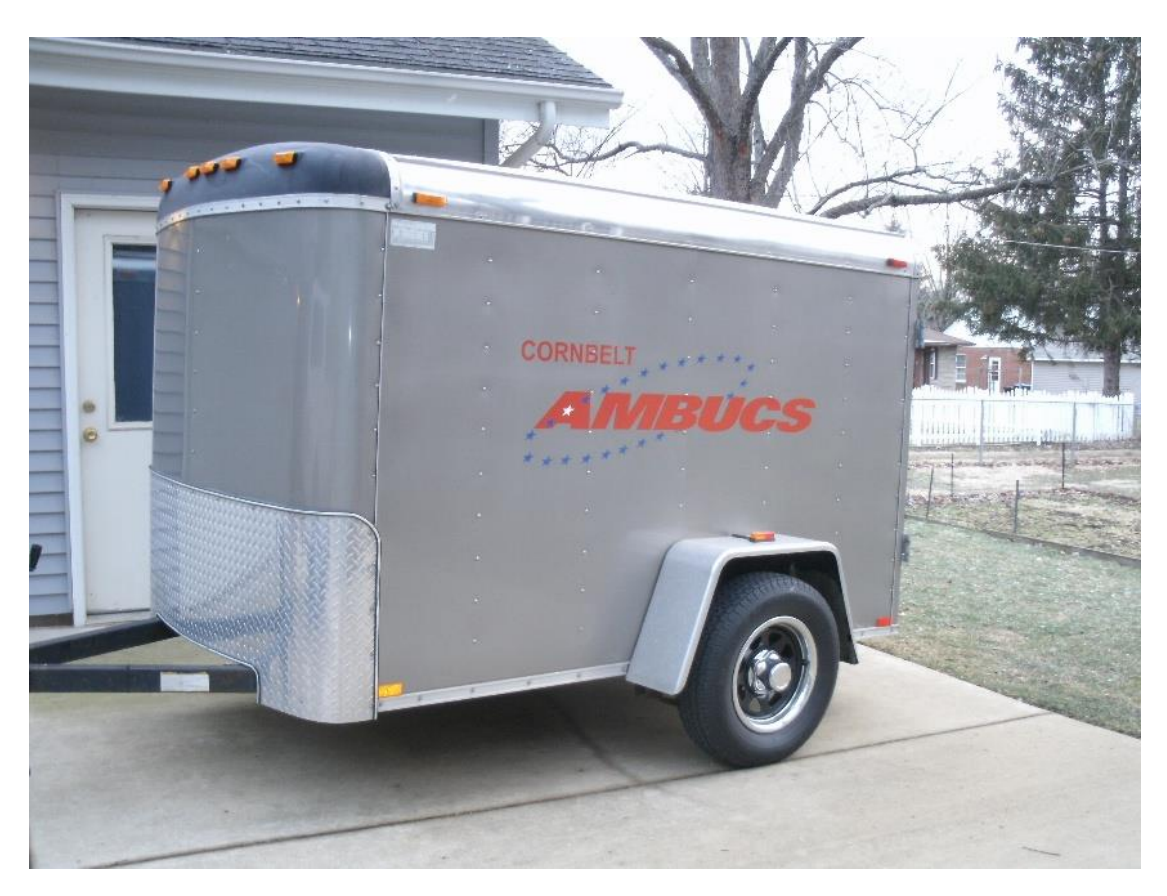
See ya' at the ramps!

No ramps in February. It's been a strange winter and the weather has been nice at times and then changes to not-so-nice the same week. It's certainly a challenge to build ramps during the winter months. Although we do have some ramps planned for this spring, we are still working on funding options to make sure we can cover materials costs for our projects. We will keep you informed when we start our ramp-building again. The trailer is stocked.. waiting to be put back into service.. so keep those toolbelts handy.. and I'll be in touch.