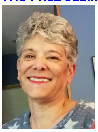
Hello Fellow AMBUCS™!

I hope you are all looking forward to a productive spring, with ramp building and the other exciting AMBUCS activities we have planned. As you are aware, our main fundraiser, the pancake breakfast, will be April 4. You should have each received your packet of information already, and will soon receive a request for volunteers to help out at the breakfast. Our other big event looming on the horizon is the regional conference. Registrations are not coming in as quickly as we had hoped they would, but we are expecting to start seeing those registrations flowing in, since the conference is next month! We are really hoping Cornbelt, especially, shows up in force, since we are sponsoring the conference.