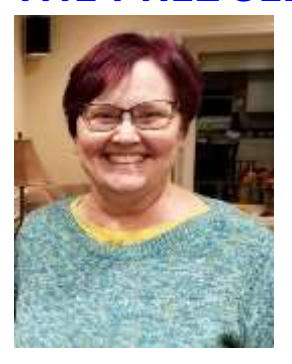
Hello Cornbelt AMBUCS™

Happy August! Summer breaks are almost over and it is time for new backpacks and school supplies. We have been keeping busy over these summer months. We are still building ramps and giving away Amtrykes along with other community service.